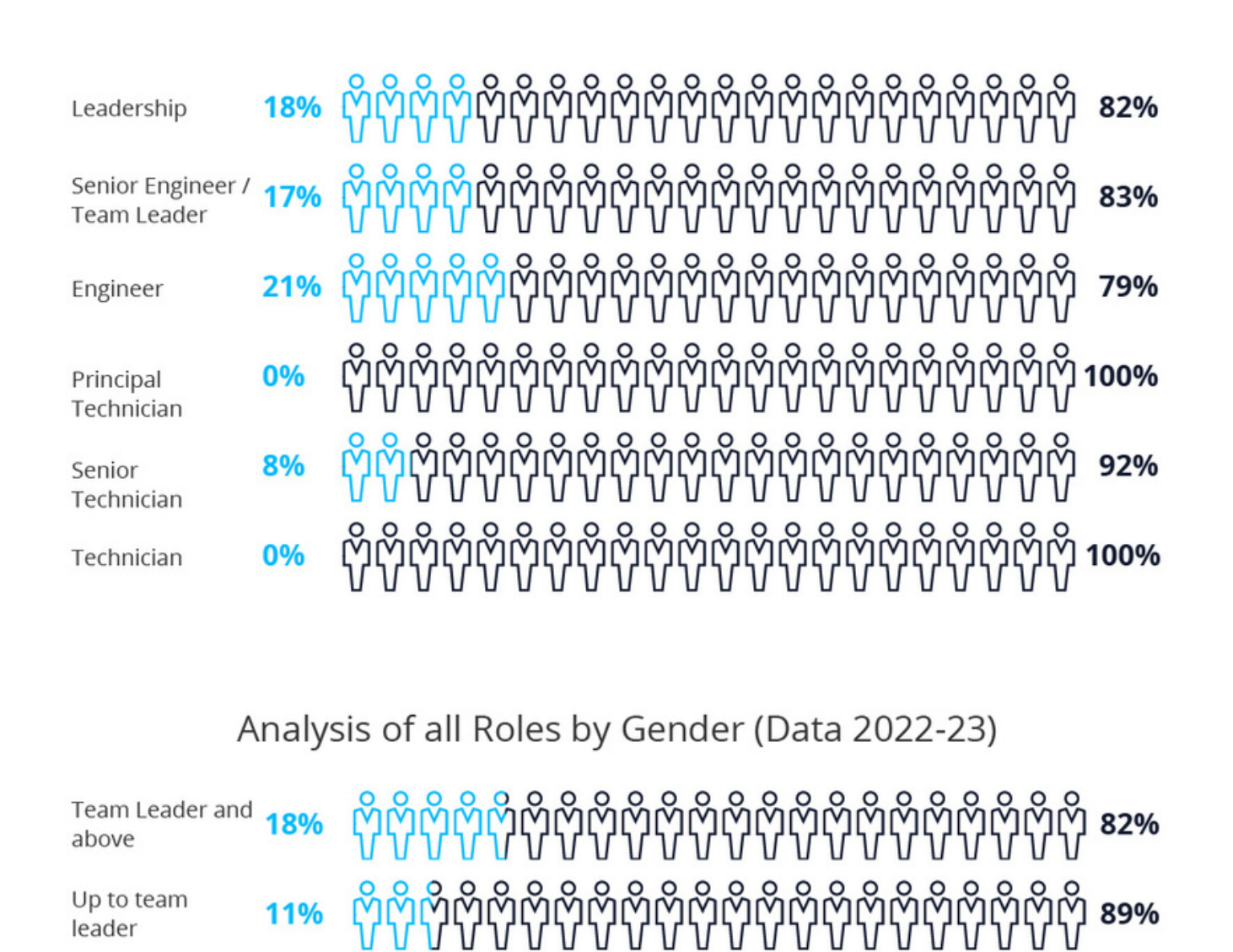
Figure 3: Analysis of technology job roles by Gender