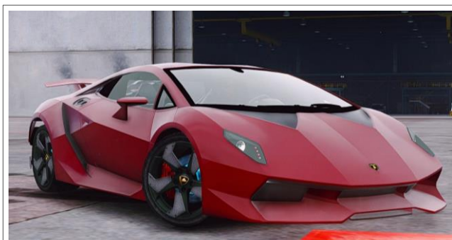
Lamborghini's 'Sesto Elemento' uses carbon fibre reinforced plastic (CFRP) panels.