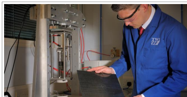
TAP rig with pierced composite laminate.